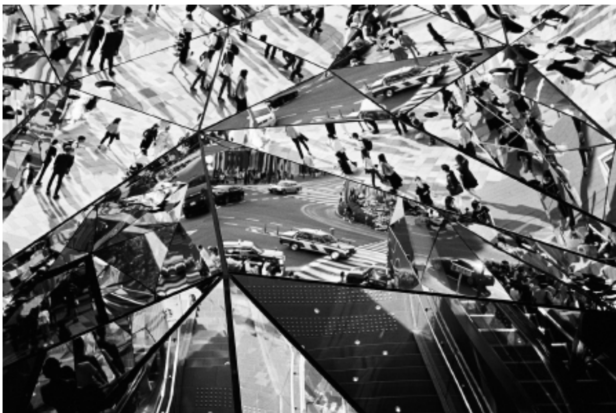
Monogatari 2020