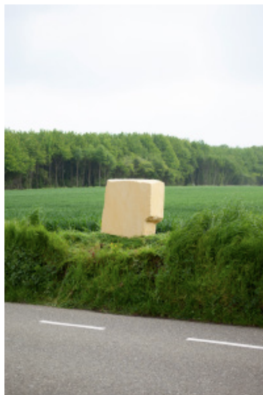
From 119m below to 152m above