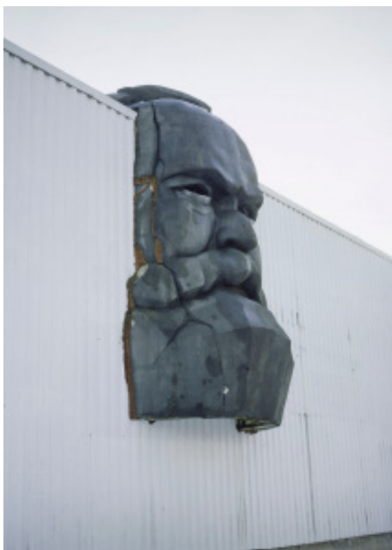
Chemnitz - Modern City